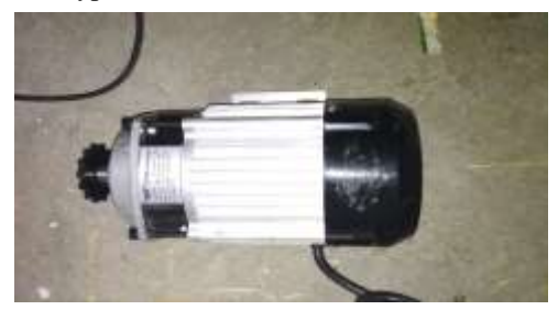
Fig.3. DC Motor

Current Rating: 7amp Voltage Rating: 48 Volts Cooling: Air – cooled Motor type: Brushless